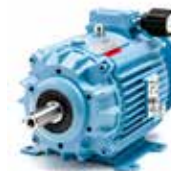
K4 (1,1-1,5 kW)