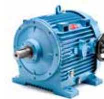
16 (5,5-7,5 kW) 16B (11 kW)