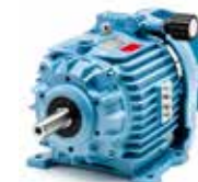
K5 (2,2-3-4 kW)